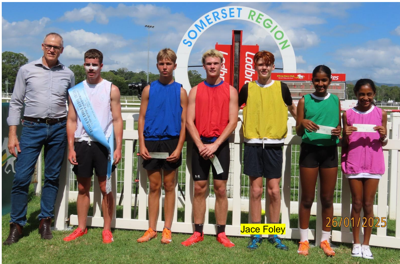
The finalists of the 120m Youths Gift.