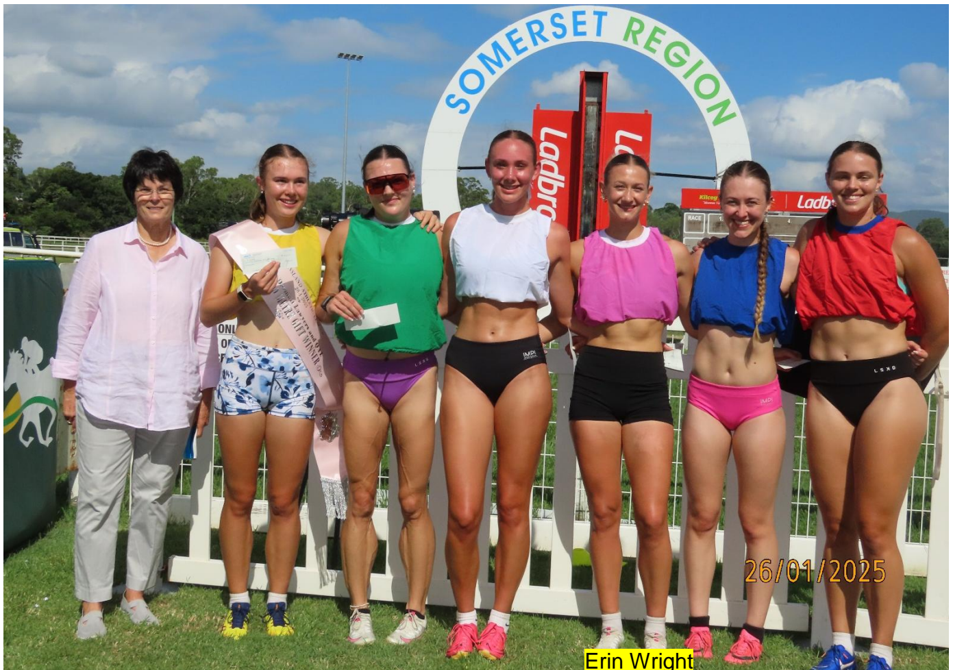
The Finalists of the 120m Ladies Gift.

Club members did well winning some money from the many gifts that was on offer.