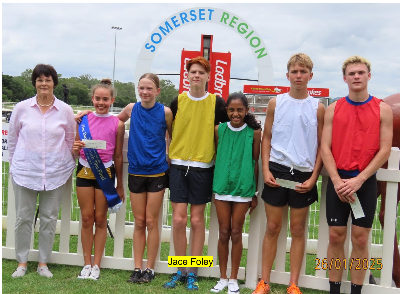
The Finalists of the 70m Youths Gift.