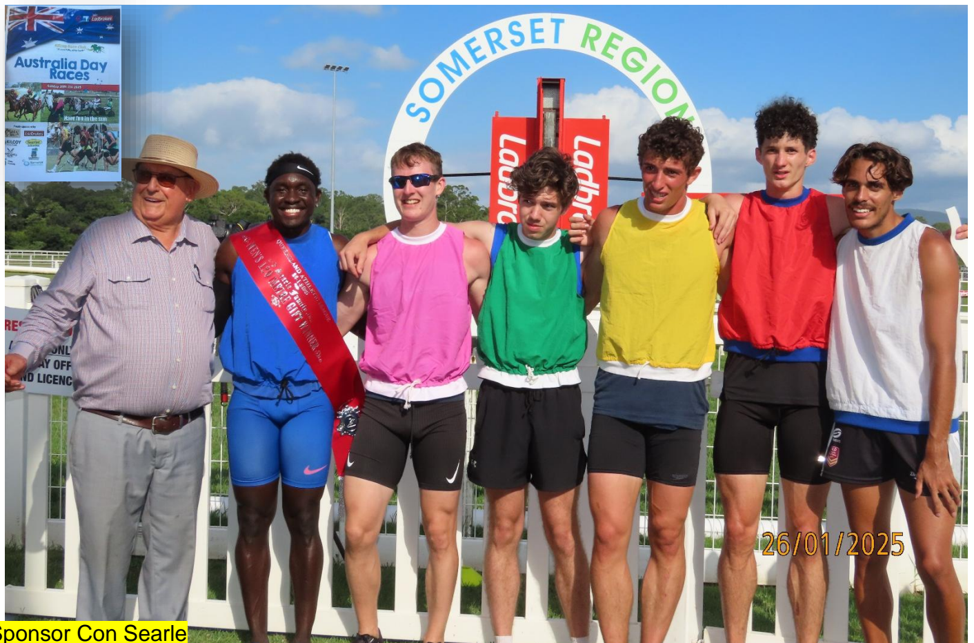
The finalists of the 120m Gift