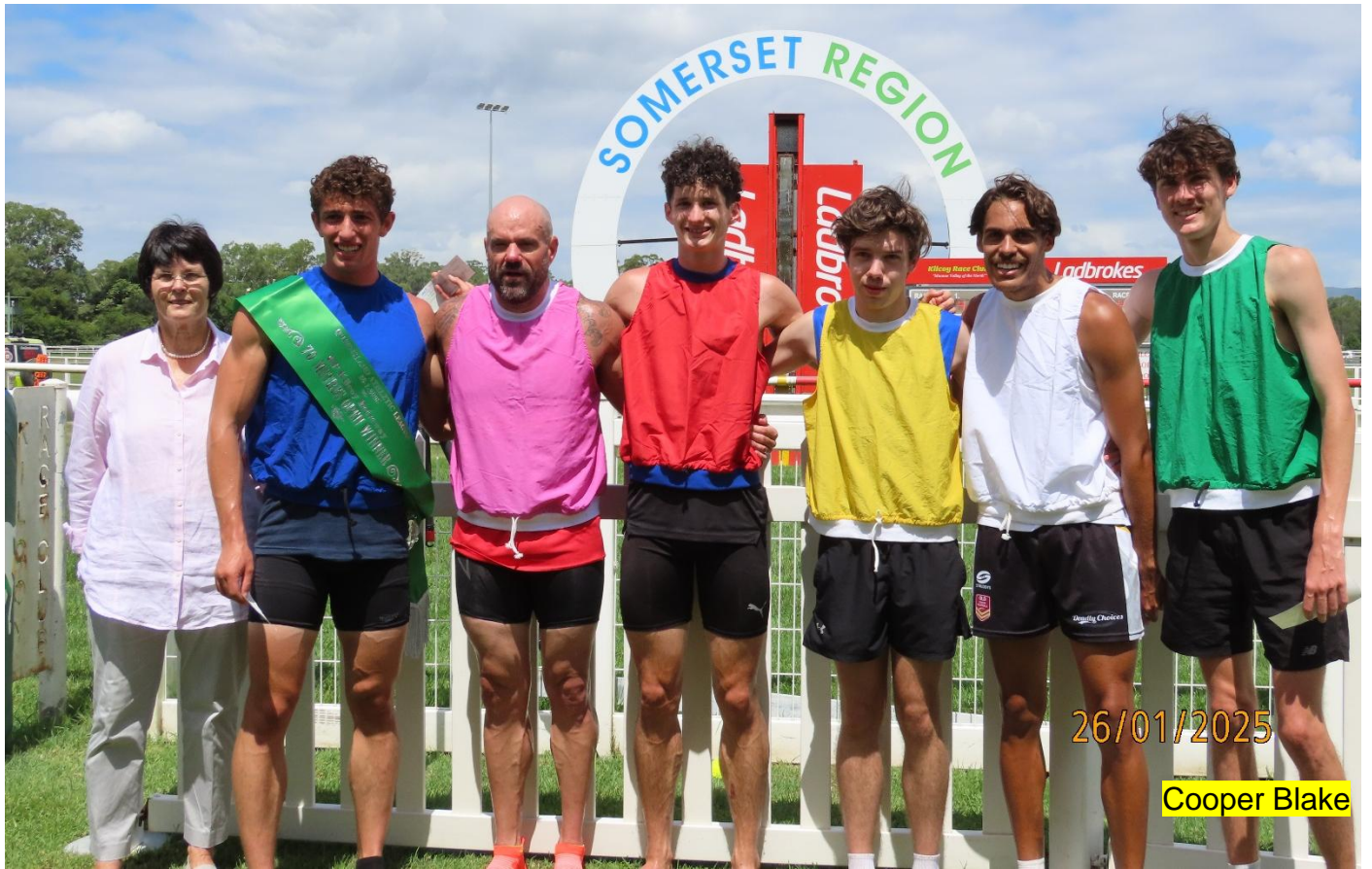
The Finalists of the 70m Open Gift.