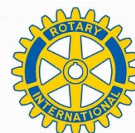
Rotary Club of Ipswich City

The Club is gearing up for the 33 rd Winter Carnival and it's on Sunday 17 th August 2014.