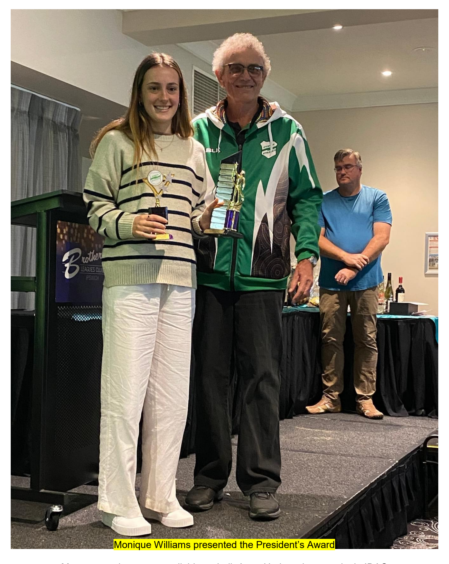
Many more photos are available at JodieAnne Harlow photography in IDAC